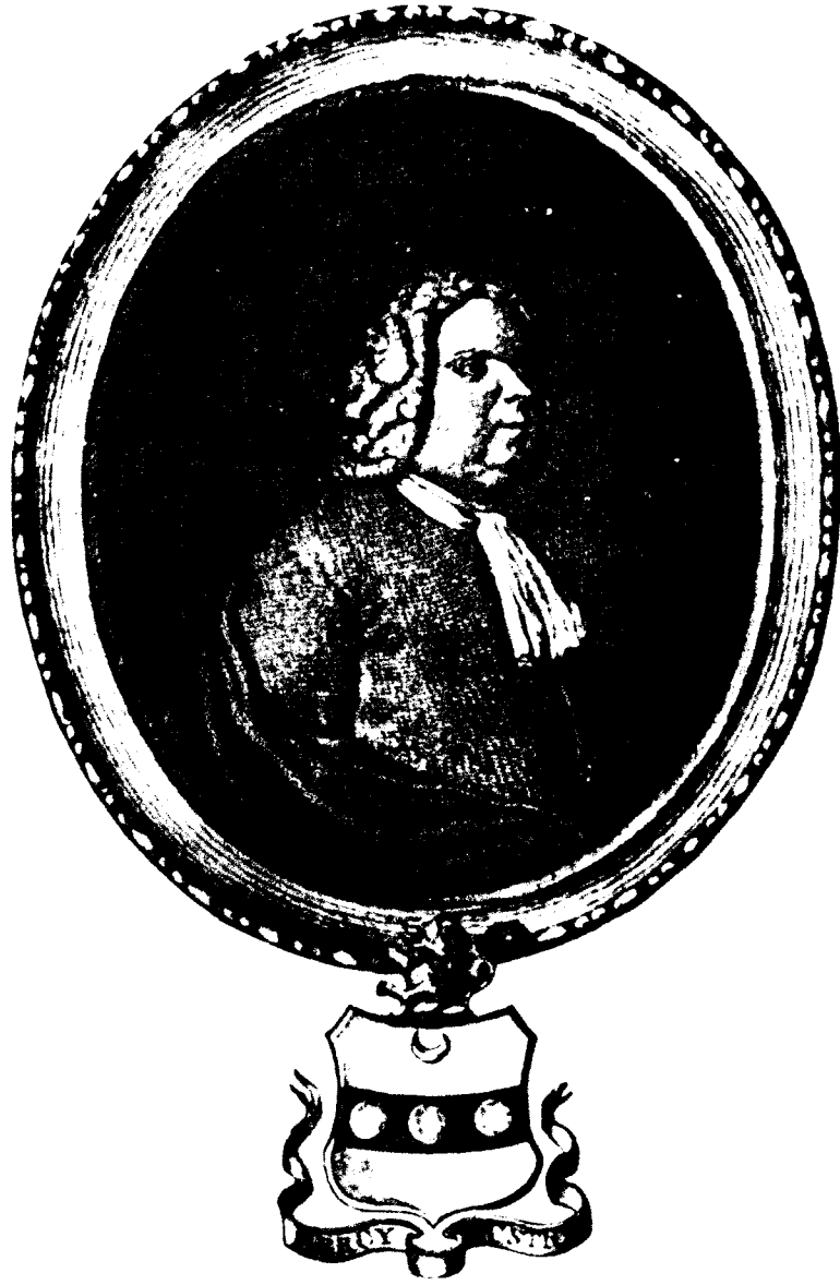
WILLIAM PENN: BEVAN CARVING