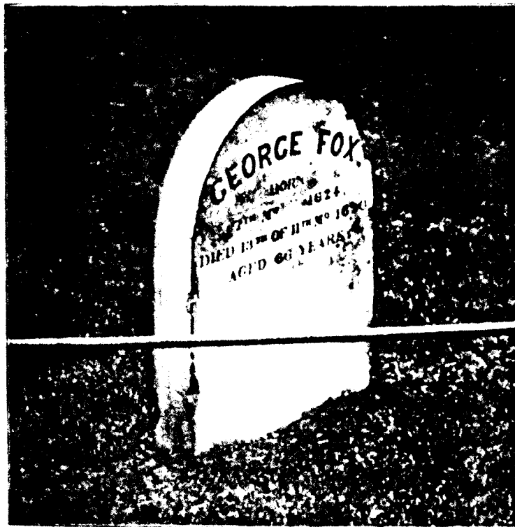
FOX'S GRAVE IN BUNHILL FIELDS, LONDON

FROM ORIGINAL PAINTING BY SIR PETER LELY, AT SWARTHMORE COLLEGE