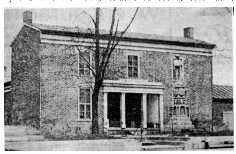
The old courthouse (above) was the center of activity in its time. (Right) Citizens crowd into the courthouse.

The 1840 county census, the first after the formation of the new county, showed a population count of 4453. Of those who were employed, and bear in mind that many of these extended households had ten or more members, including children and women (who were without professions), the predominance, a total of 1202, were in agriculture. By this time the newly established county seat had begun to prosper around the