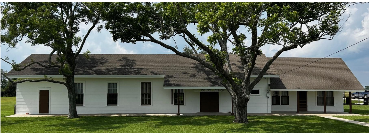
Mopac House—May 31, 2025

The first get-together was held under a tent, with other settings being the Hotel Collegeport, the Collegeport Pavilion on the Tres-Palacios Bay, and finally the Mopac House Community Center. The Mopac House was constructed of materials salvaged from the decommissioned St. Louis, Brownsville & Mexico railway station and connected to the Collegeport Public Library. The Mopac House opened on May 4, 1935, and later that month Collegeport Day was observed here with an attendance of about 200 persons. Collegeport Day homecomings have been held here since that time, and are now observed each year on the LAST SATURDAY of May.