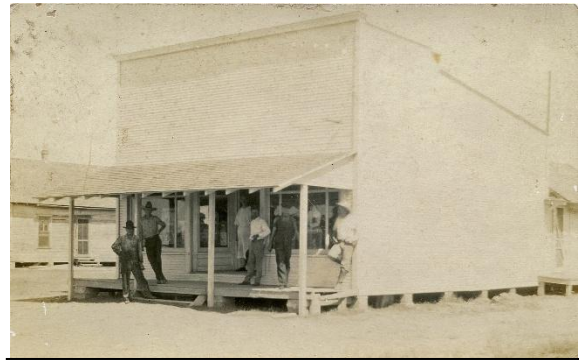
Drug Store at Turnerville (1920's)