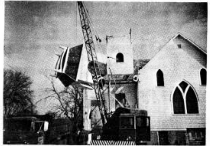
Bell and Tower were taken down for safety reasons. April 1973.