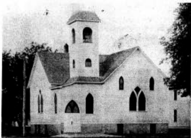
Trinity Church - Remodeled 1905

(August 1911 - parsonage and barn painted . . . cost - $66.95.)