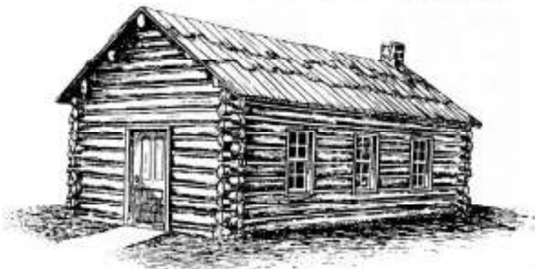
First Zion Evangelical Church. 1881-1888