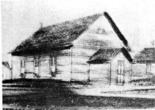
First Trinity Evangelical Church