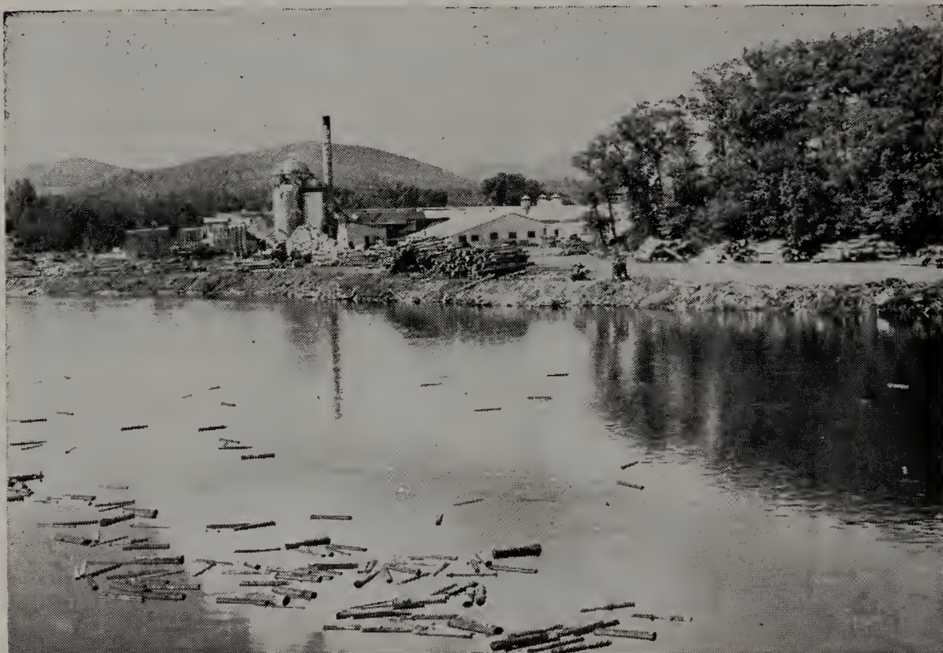
The Allen Quimby Veneer Company — 1936-1962