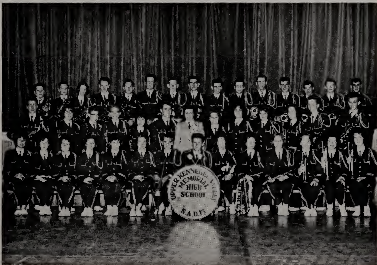
BINGHAM BAND — 1962