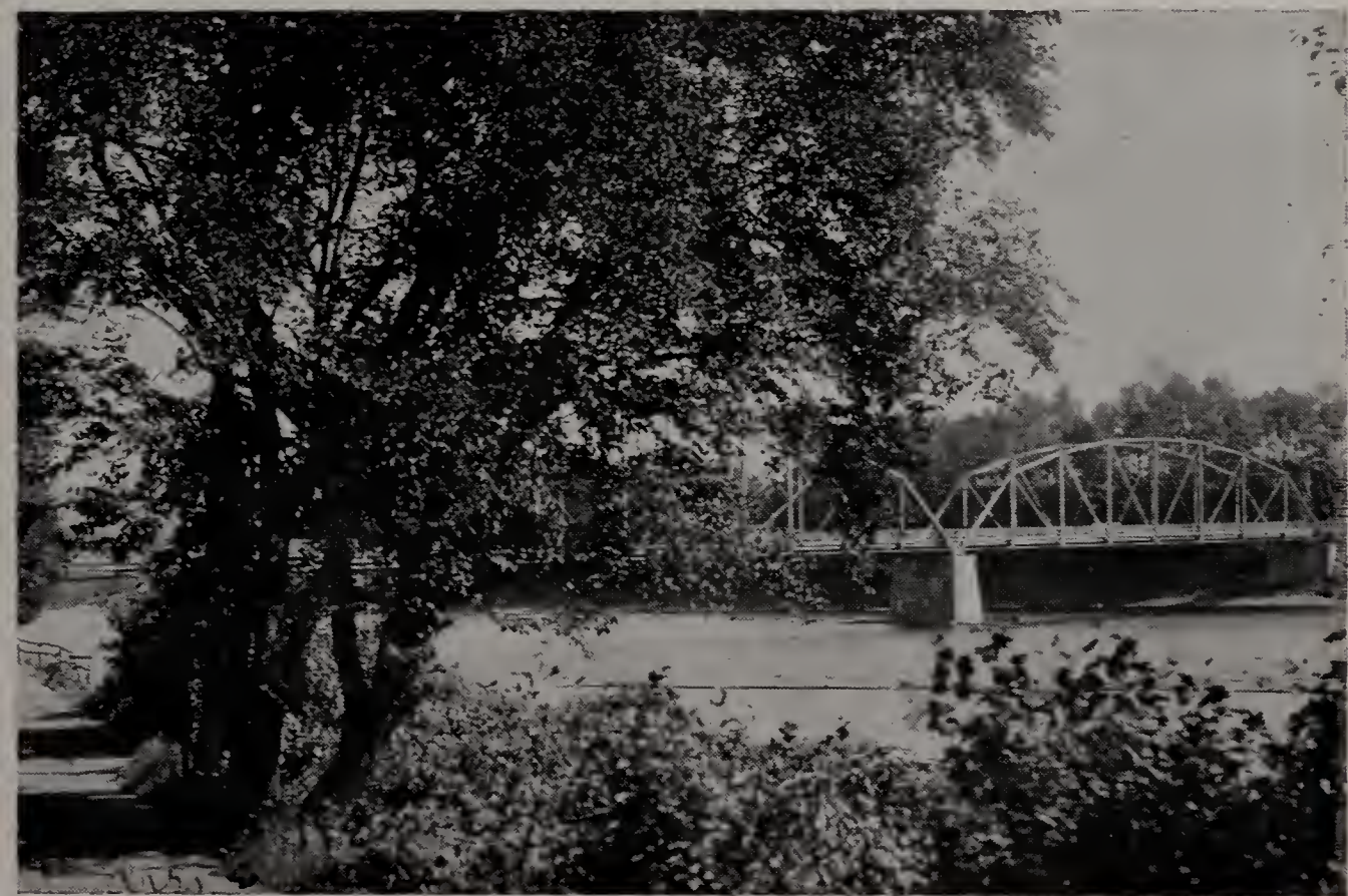
BINGHAM-CONCORD BRIDGE — Built in 1905.