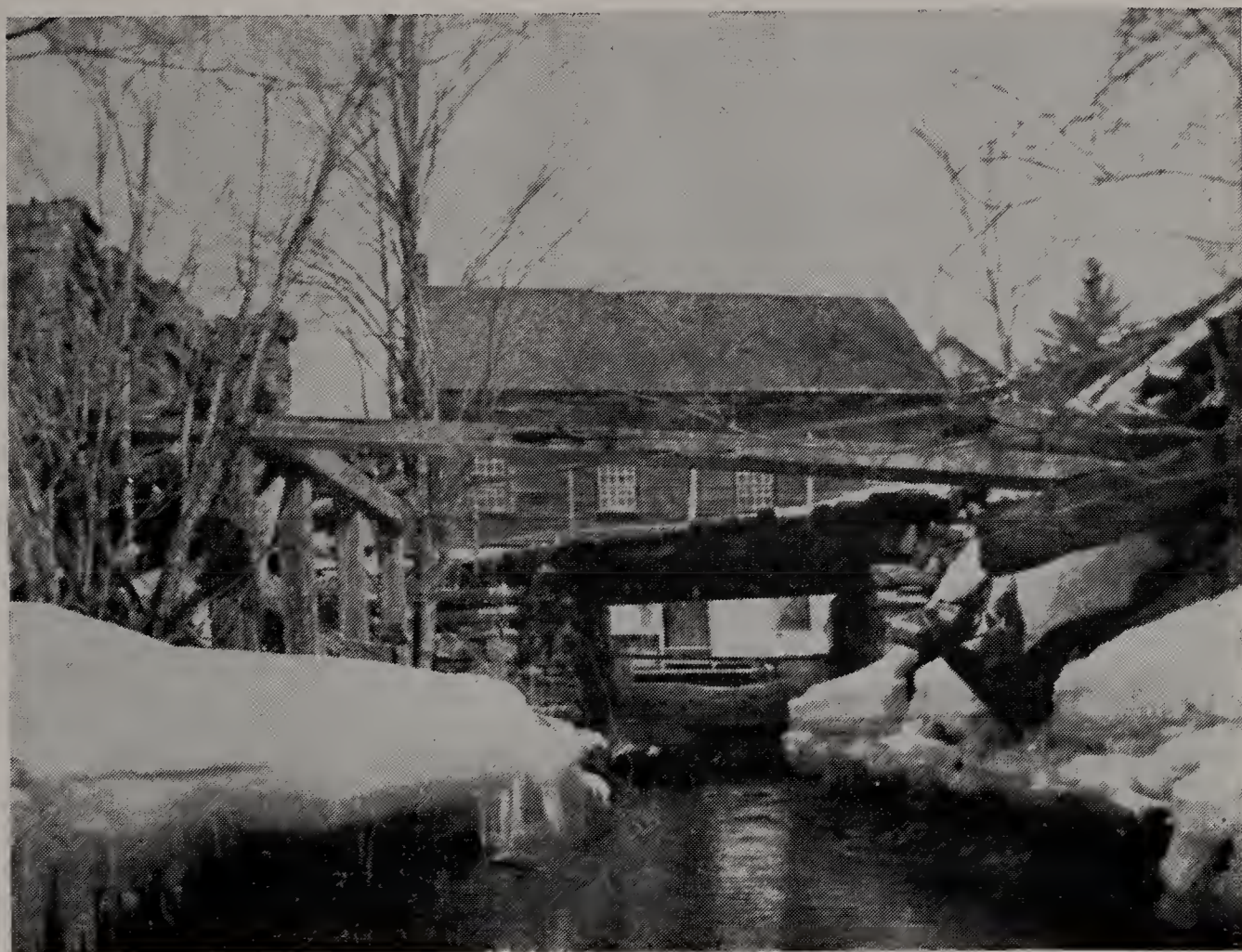
The Old Sawmill

Many years later, another plant using the same methods operated in a building near the old Bingham railroad terminal. It was operated