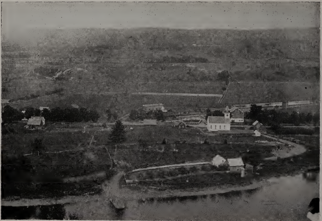
The Old Ferry located where the Bingham-Concord Bridge now stands. This photograph was taken by Willis B. Goodrich in 1891 from Old Bluff Mountain looking east.

—EVA D. BACHELDER, Seventeenth Town Clerk of Bingham