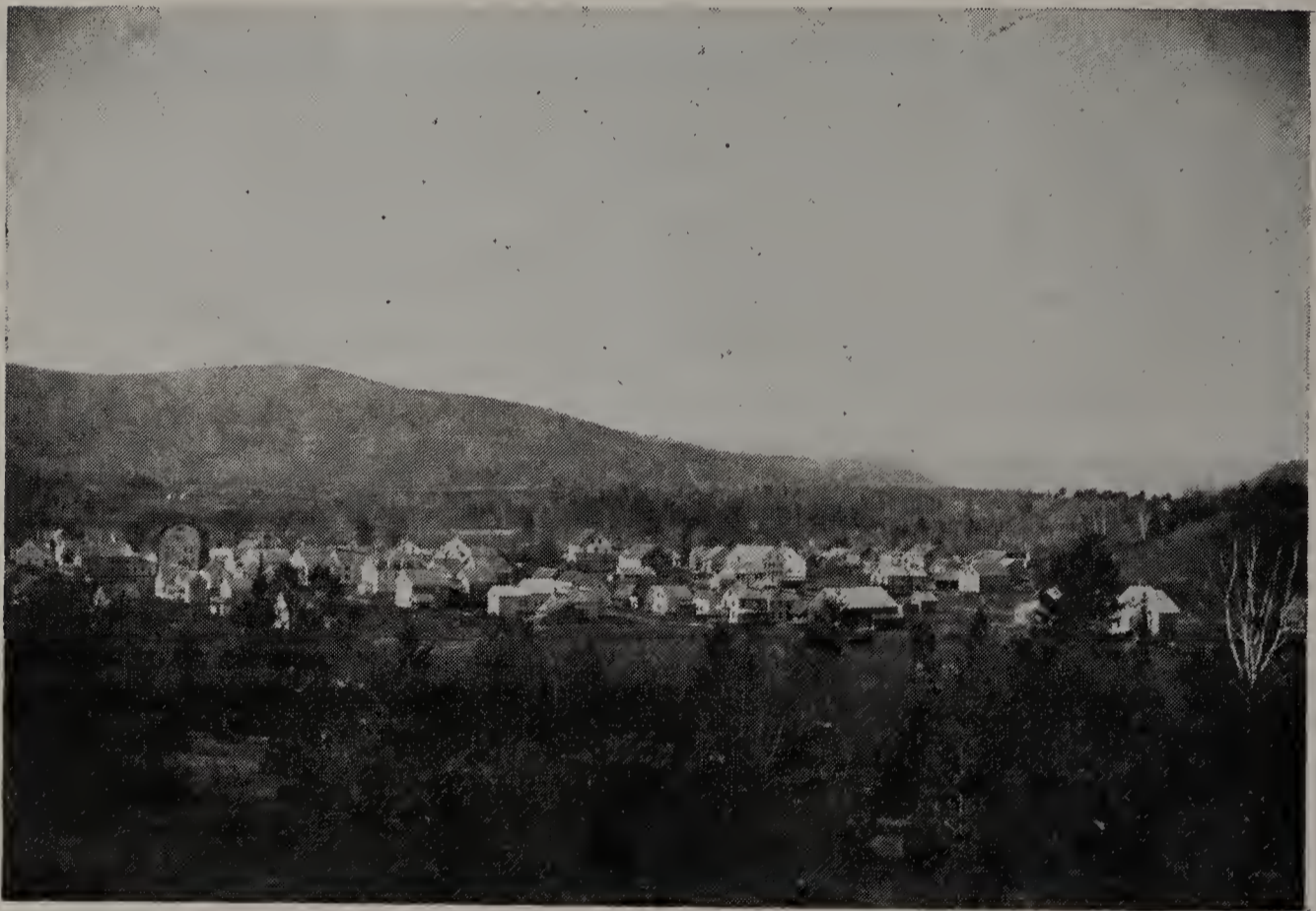
Bingham Village in 1909 taken from the east.

(Published in the National Anthology of Father Verse. )