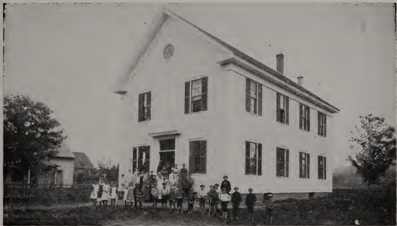
SCHOOLHOUSE BUILT 1878. Miss Nellie Baker, teacher.

The McKinley building, which stood on the back of the lot, was built in 1894 when an increasing population caused a congestion in