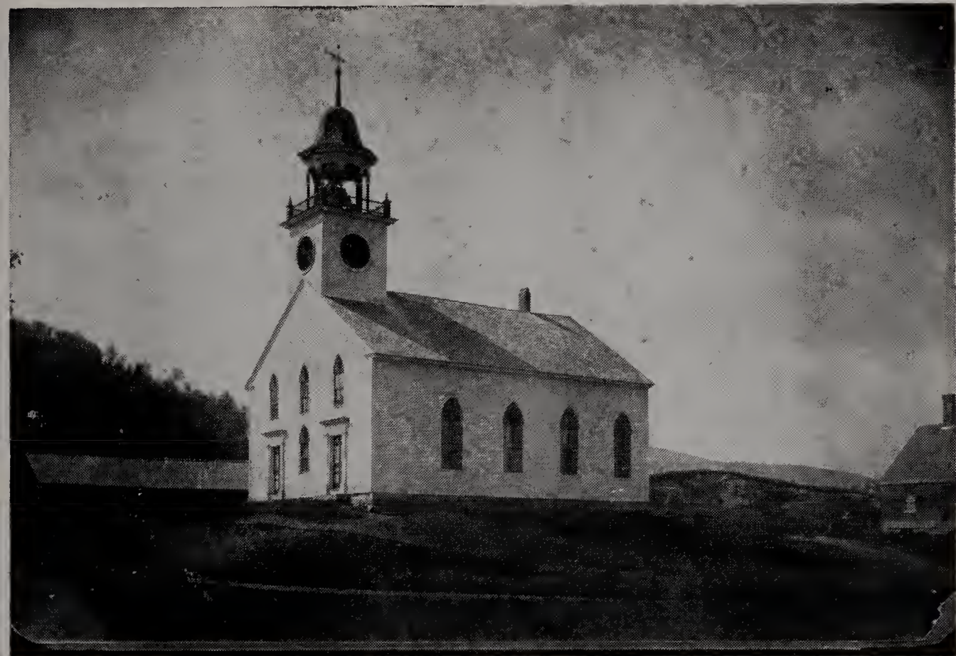
The Old Church and Horseshed Built in 1836.

About this time the idea was beginning to form of building a new Congregational Church, and to this end, the women of the newly formed organization began working. It was a huge undertaking for this little group and presented a tremendous amount of work. Their first efforts, a Church Bazaar, netted the sum of $250.00, which immediately started the fund for the new Church. For the first two years this group was absorbed in raising money for this project. Innumerable sales, suppers, exhibitions, minstrel shows and ice cream