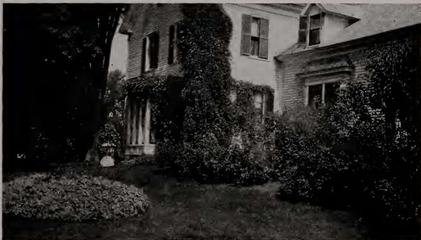
ROBERT MOORE HOME — Built about 1830.

It is certain that these early citizens served willingly because of the protection afforded by such a group in those uncertain times.