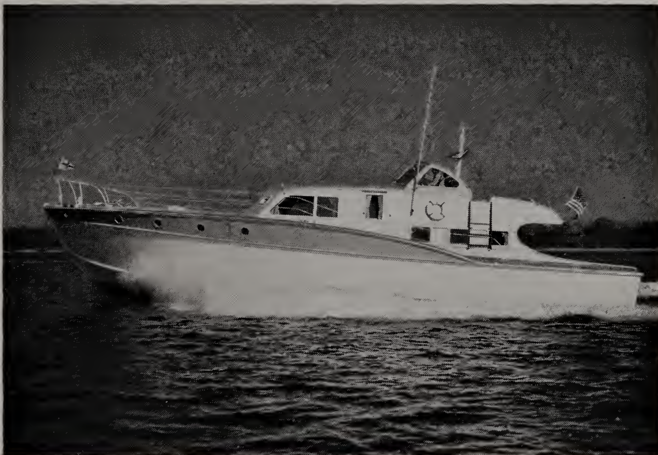
Sixty-Foot Bristol Gull built in Bingham, Maine, by Bristol Yacht Division of Allen Quimby Veneer Company.