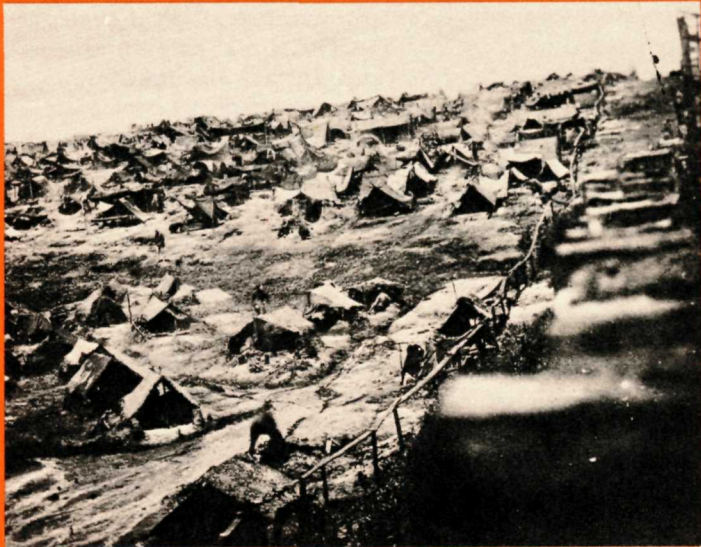
Huts built on the "deadline," August 1864, looking north-east from a "Pigeon-Roost" atop the stockade. Note the "deadline" at right.