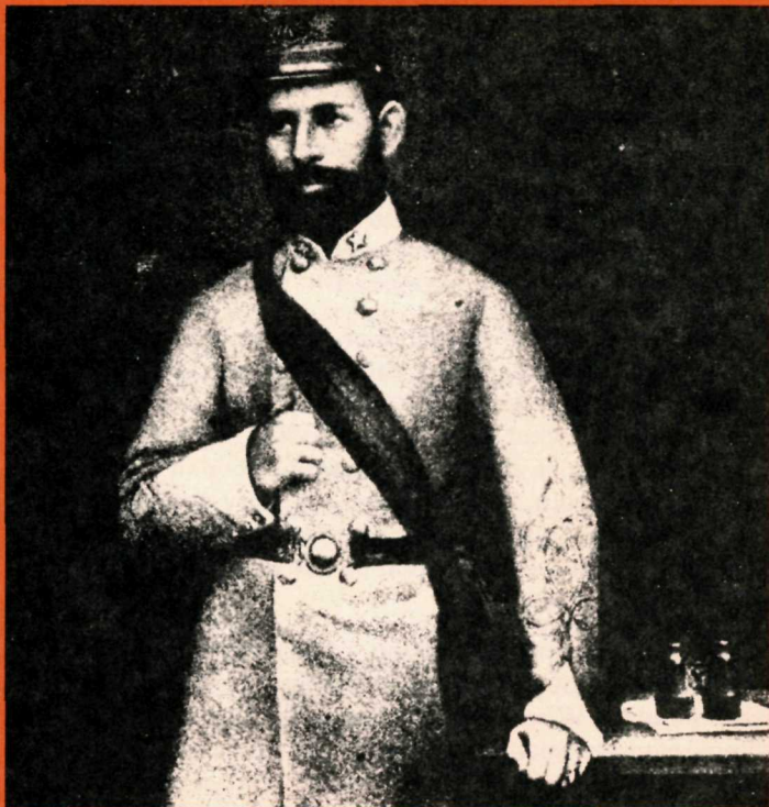
Capt. Henry Wirz, commandant of Andersonville prison camp, March 1864—April 1865.