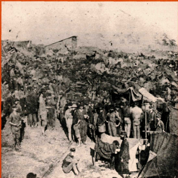
Issuing rations to 33,000 prisoners, August 1864. This photograph was probably taken near the North Gate on Market Street.