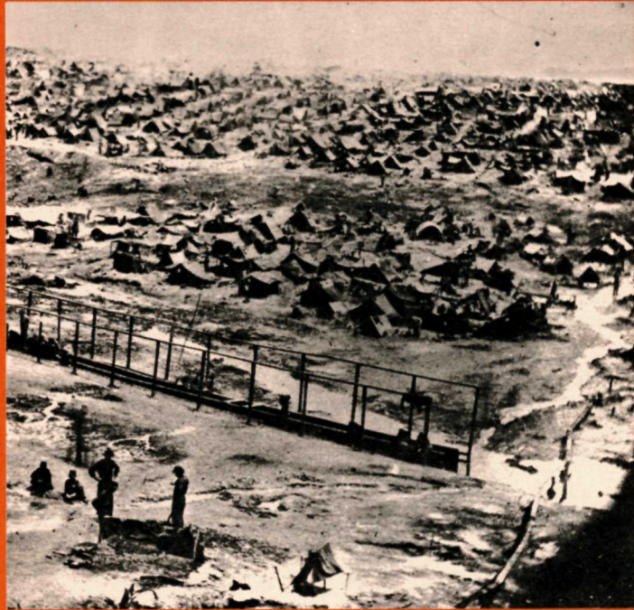
Andersonville, August 1864, looking northwest across the enclosure from a point on the stockade southeast of the sinks.