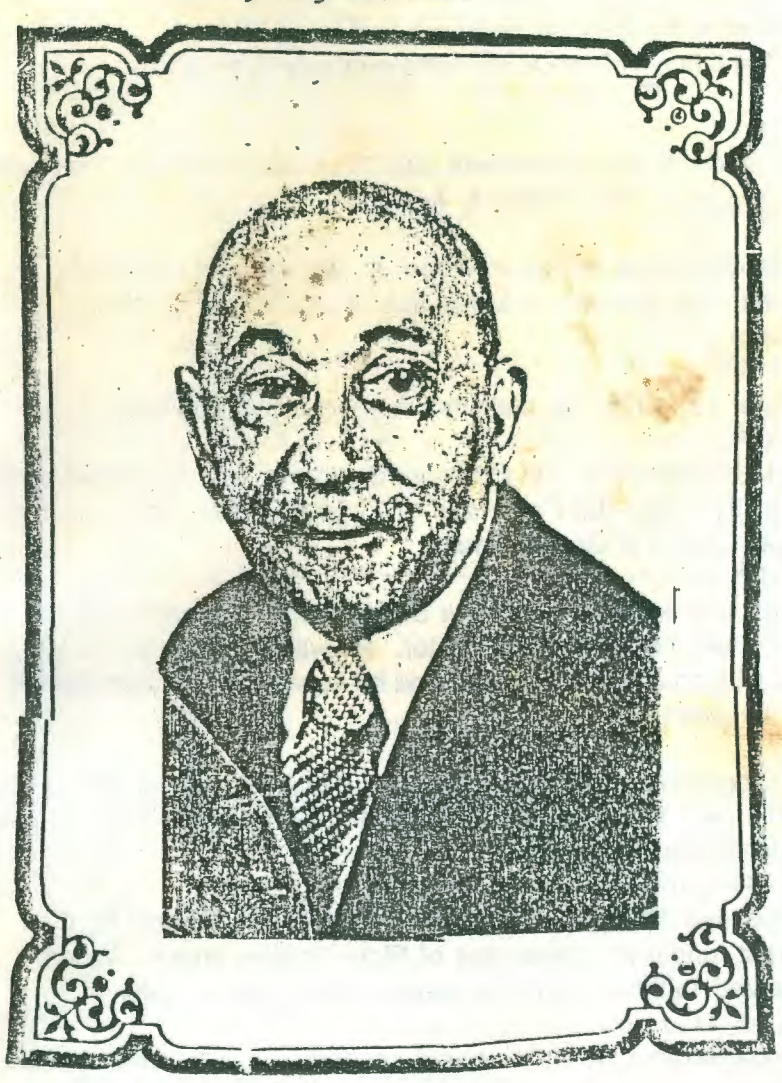
July 8, 1988