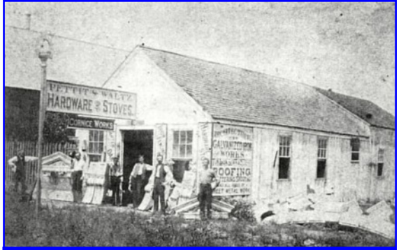
Photo of Pettit & Waltz shop in Denison, Texas, latter 1800's.