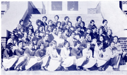
GIRLS' CHORAL CLUB