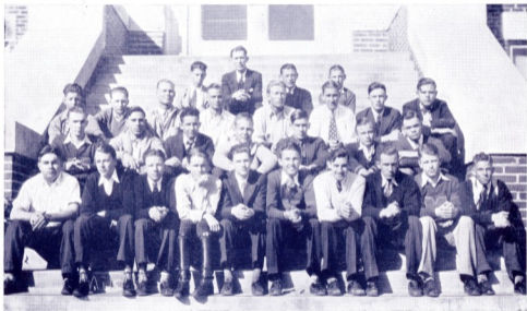
FUTURE FARMERS' CLUB