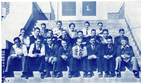
BOYS' GLEE CLUB