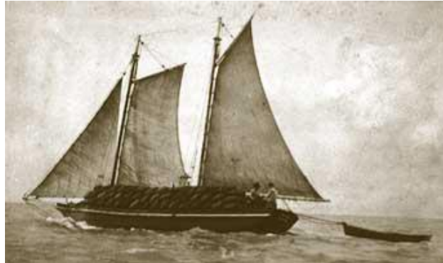
The shallow drafted Scow Schooner