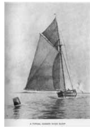
Typical Hudson River Sloop