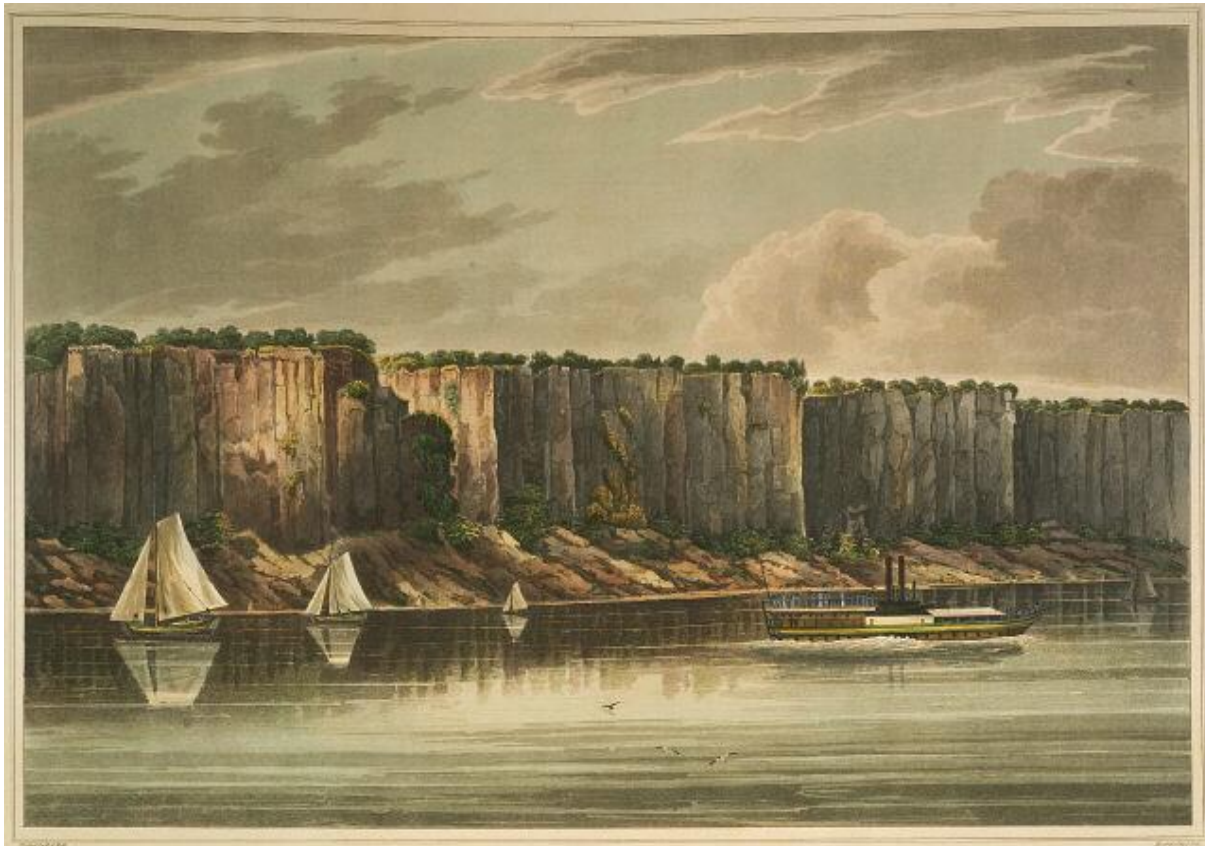
The Hudson River Palisades